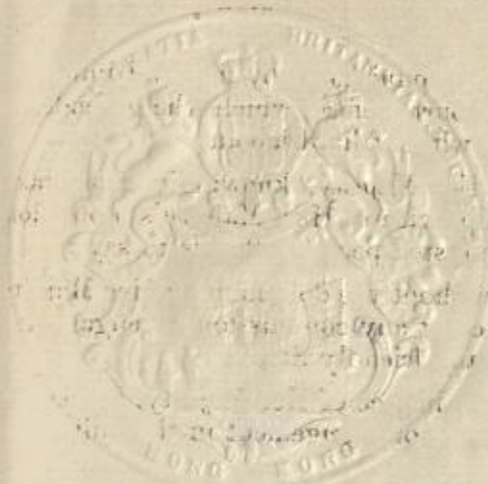
Major-General, Officer Administering the Government.