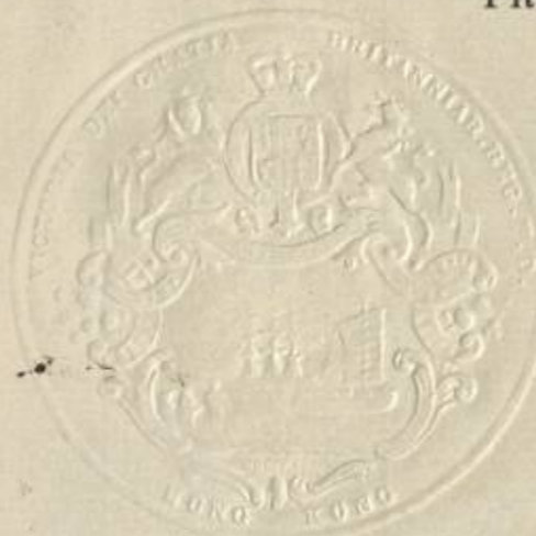
Major-General, Officer Administering the Government.